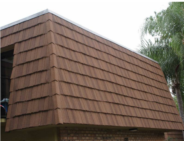
MANSARD WALLS REPLACED 2018