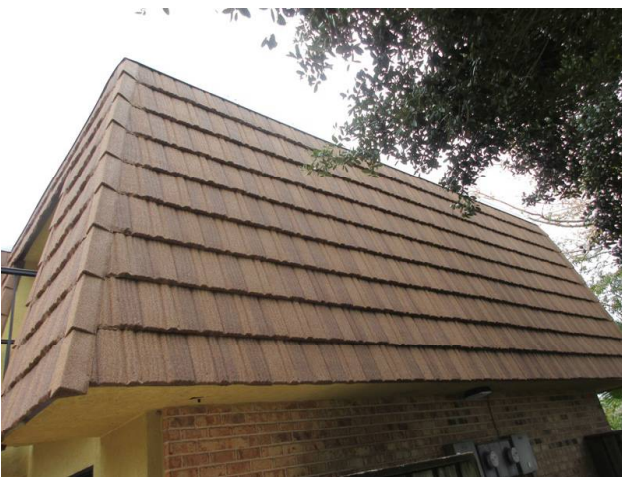
MANSARD WALLS REPLACED 2018