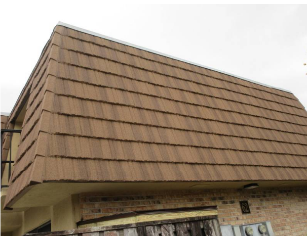
MANSARD WALLS REPLACED 2018