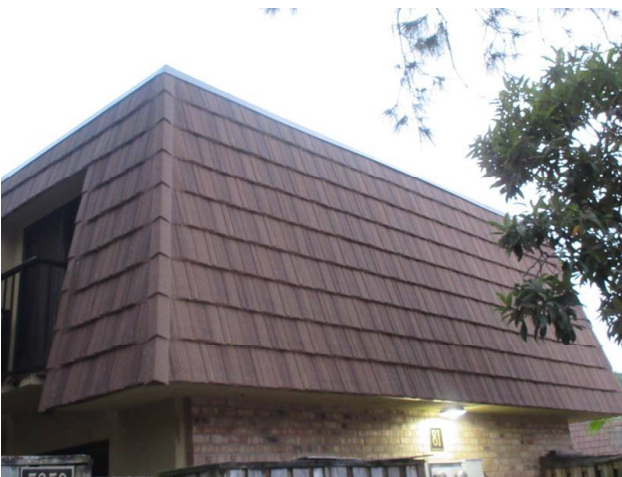
MANSARD WALLS REPLACED 2018