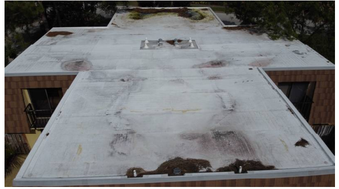
ROOF - CONCRETE WITH TPO COVERING