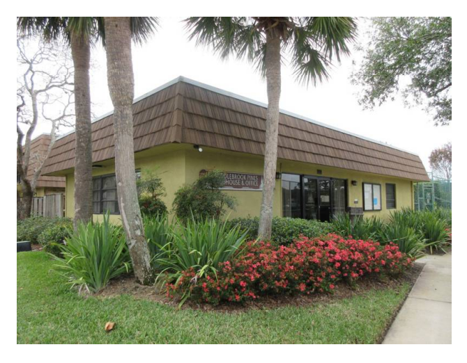
FRONT LEFT ELEVATION