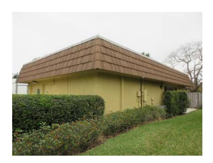
RIGHT REAR ELEVATION