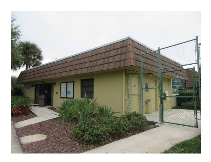
FRONT RIGHT ELEVATION