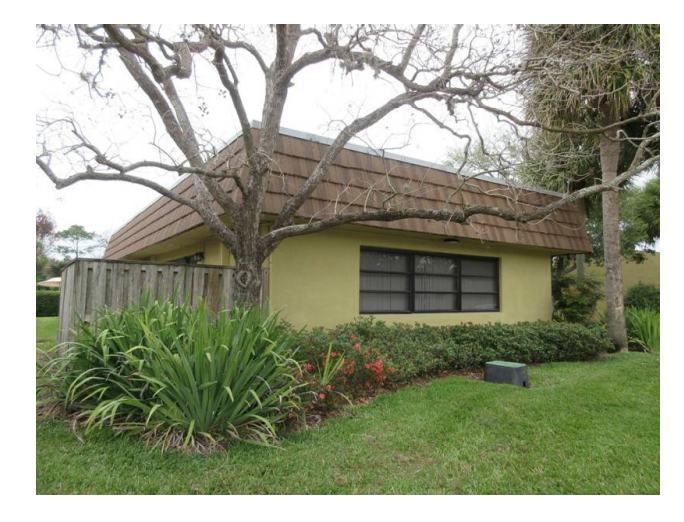
LEFT REAR ELEVATION